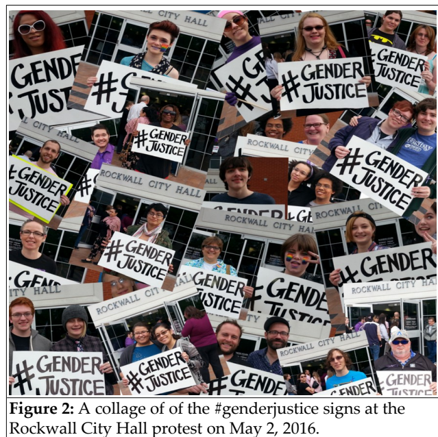
Figure 2: A collage of of the #genderjustice signs at the Rockwall City Hall protest on May 2, 2016.

Healthcare —In 2016, our efforts in healthcare fell off somewhat due to increased efforts in other areas and a lack of success increasing our capacity to take on all. We continued to discuss healthcare access options with trans persons contacting TPI and looking for resources. This is a service we routinely provide to about a dozen or more persons each year who cold-call us for referrals. In addition, the following are some of the more significant efforts undertaken during the year.