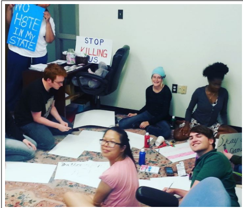
Figure 1: On the opening day of the TPI community space, about 20 – 25 volunteers filled the office working on action planning for a protest of a proposed anti-transgender ordinance. Shown are a few of those making signs for protesters.

FY 2016 marked a very significant turning point for TPI. In January, we operated a kind of “pop-up” office in the front of the Community Pharmacy on Cedar Springs Road once a week. Although drop-in visitation was limited, having a physical space, even if temporary, was well received. When we learned of an inexpensive office space in Oak Cliff, we decided to rent our